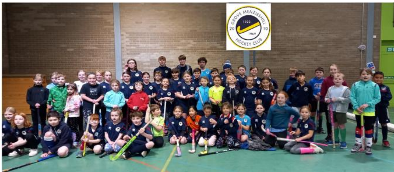
Youth Indoor Hockey Training session

The primary objective of the club is to increase participation in the sport of hockey within the Dundee area. Further progress has been made in achieving this objective. The club actively raises funds to support this.