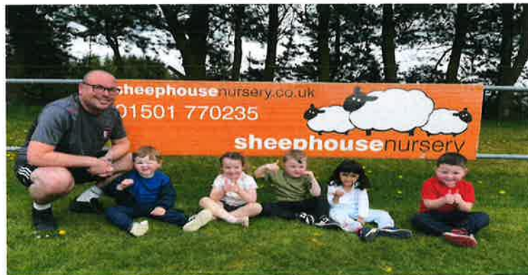
6. Some of the local Nursery children enjoying a visit to Park View.