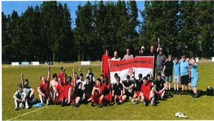
5. Participants in the highly successful activity sessions.