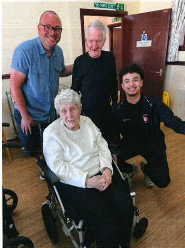
9. Members of the Trust visit the residents of a local sheltered housing complex.