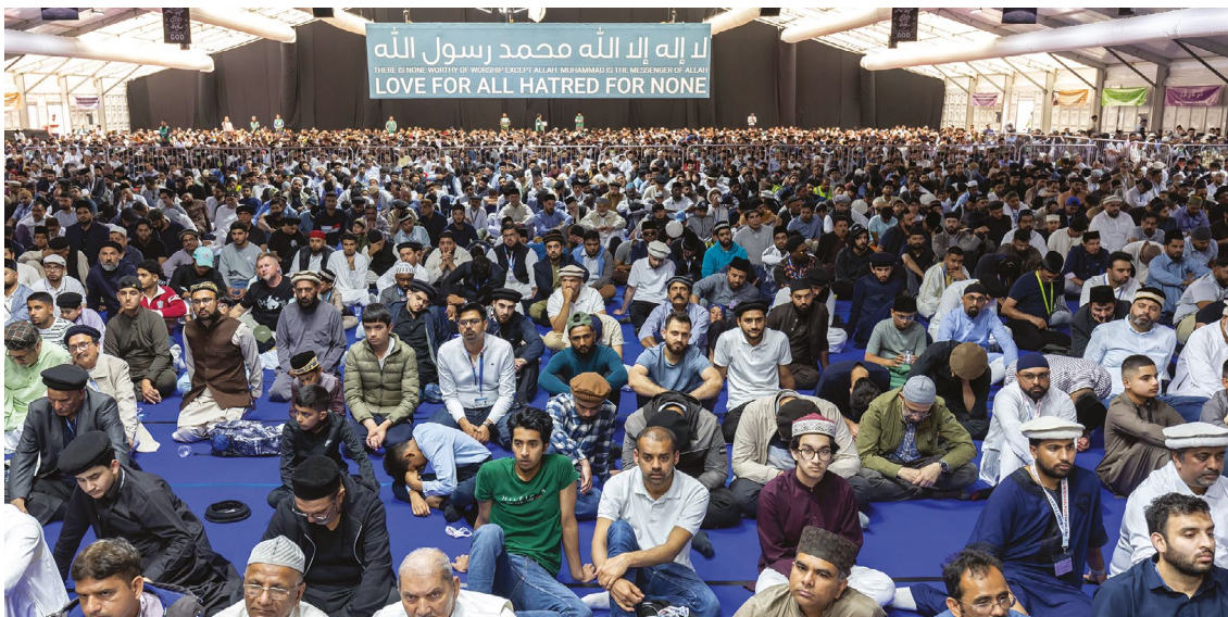
Jalsa Salana 2024: A Year of Blessings and Progress