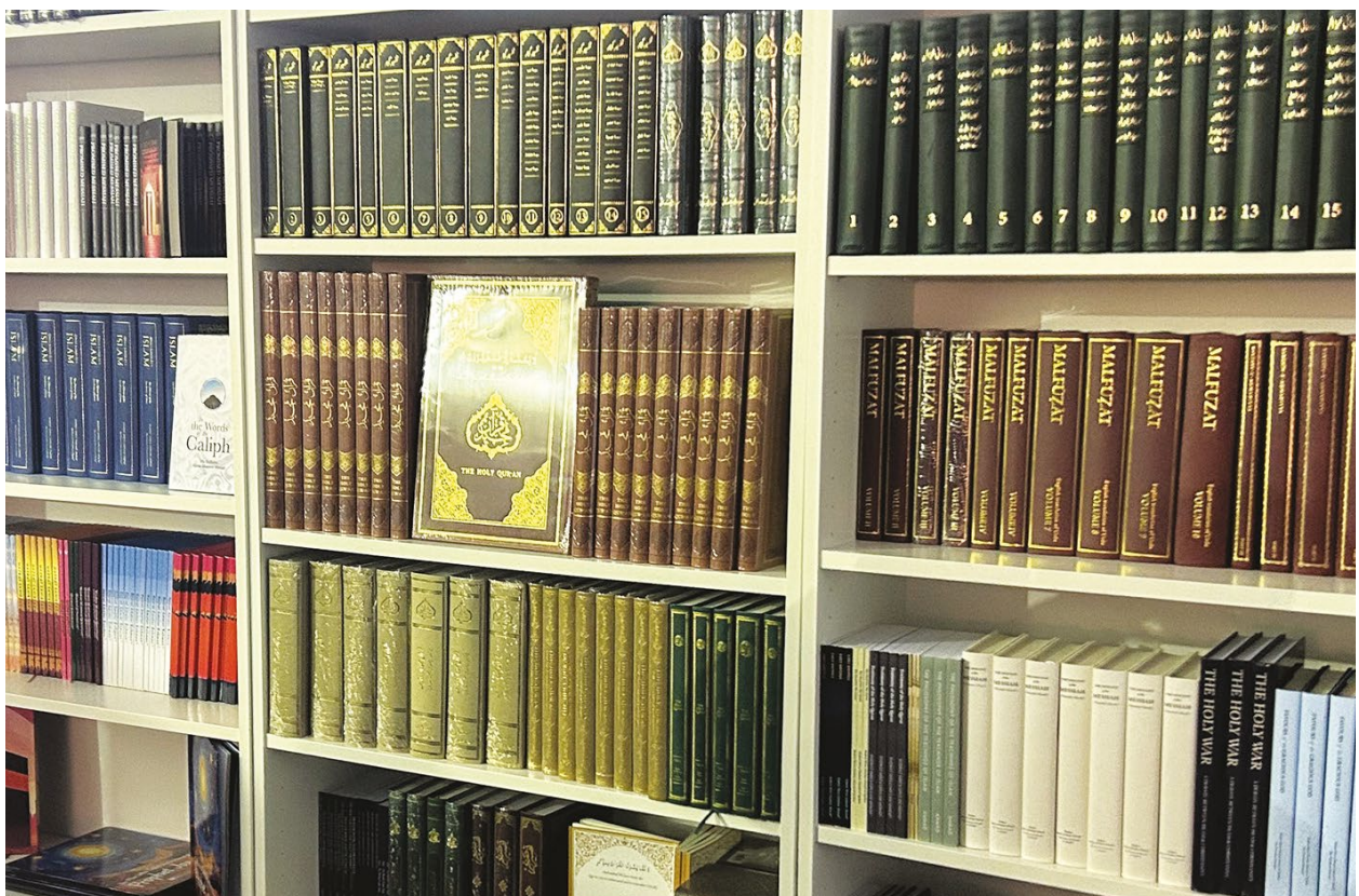
Isha'at (Literature & Publications), Increased distribution of the Holy Qur'an

This year, special focus was placed on increasing the distribution of the Holy Qur'an. It encouraged establishing home libraries, set up bookstalls at Friday prayers and promoted literature so that every home may become a beacon of spiritual knowledge. In partnership with Al Islam, the department launched a digital interactive library and engaged educational tools, including audio prayer cards and a new edition of the 'Sawab Journey' board game, nurturing Islamic learning across all generations. Mosque libraries throughout the UK have been updated. Strong ties were developed at the London Book Fair, including collaboration with Beijing Ruxue International Media in China. Efforts continue to expand Qur'anic sales and publications through this partnership and with Penguin Random House.