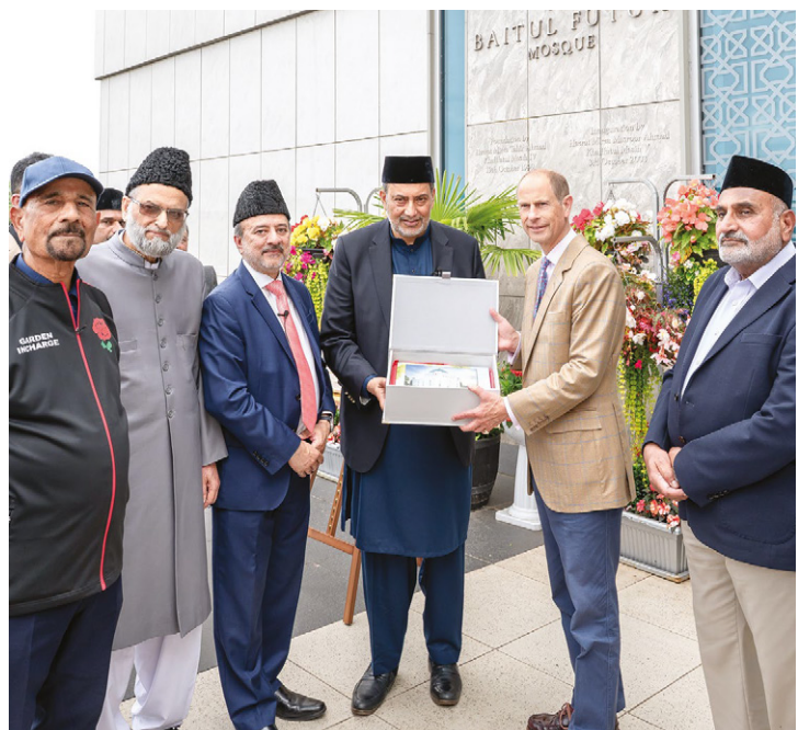
Zira'at (Agriculture & Horticulture), First place - London Garden Society's Summer Bloom Competition 2024