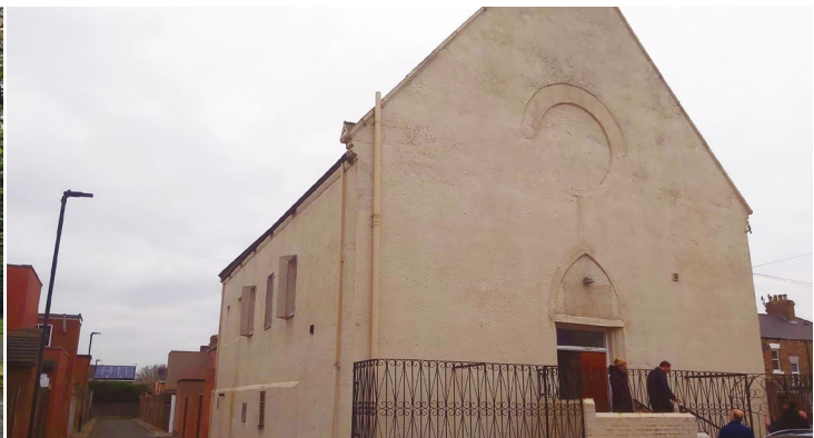
Newcastle Mission House

donated to local charitable causes benefitting the people of Hartlepool.