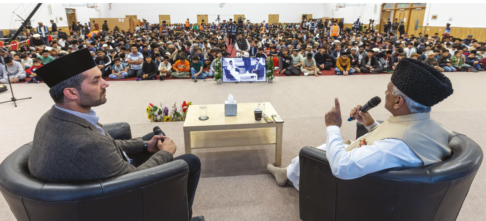
Waqf-e-Nau (New Dedication) Scheme, Waqf-e-Nau Ijtema

The Waqf-e-Nau scheme is a blessed and divinely inspired initiative dedicated to nurturing a generation committed to the service of Islam and humanity. Children enrolled in this sacred scheme are raised with a profound sense of purpose, sacrifice and spiritual awareness, fostering a lifelong dedication to the teachings of the Holy Qur'an and the guidance of Khilafat. Continuous efforts were made throughout