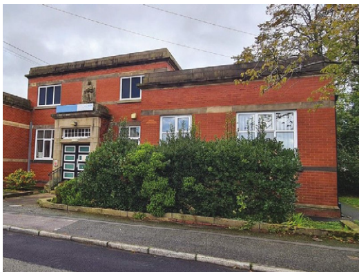
Bolton Mission House

By the grace of Allah the Almighty, we were blessed this year with the opportunity to acquire two new mission houses to serve our needs. The first in Horwich, Bolton, which was a former health clinic, is in a prime and accessible location, ideally suited for community activities in that area. The second is in Newcastle, where, after many years of searching, the local branch has successfully acquired a detached, two-storey property, previously a Kingdom Hall of the Jehovah's Witnesses but now ideal for Community purposes. Progress continues in Dunfermline, Edinburgh and Roehampton.