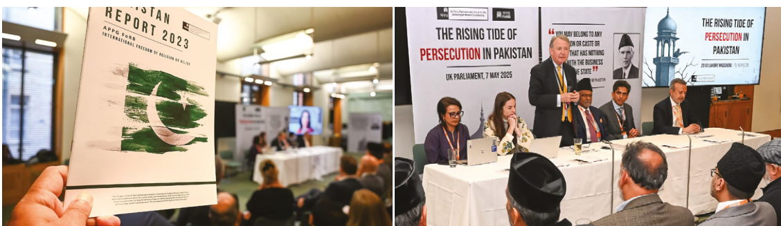
Umure Kharijiyya (External Affairs), The Rising Tide of Persecution in Pakistan Event

Despite ongoing economic challenges, the Finance Department has experienced growth across nearly all major financial areas. Obligatory donations have continued to increase year after year. The online donation portal ( www.chanda.org.uk ) remains a steady and vital source of income, with both existing and new members regularly contributing across the UK. Strict budgetary controls across national departments, salaries, utilities, and all UK missions and branches were maintained. Enhancements in real-time financial reporting have strengthened