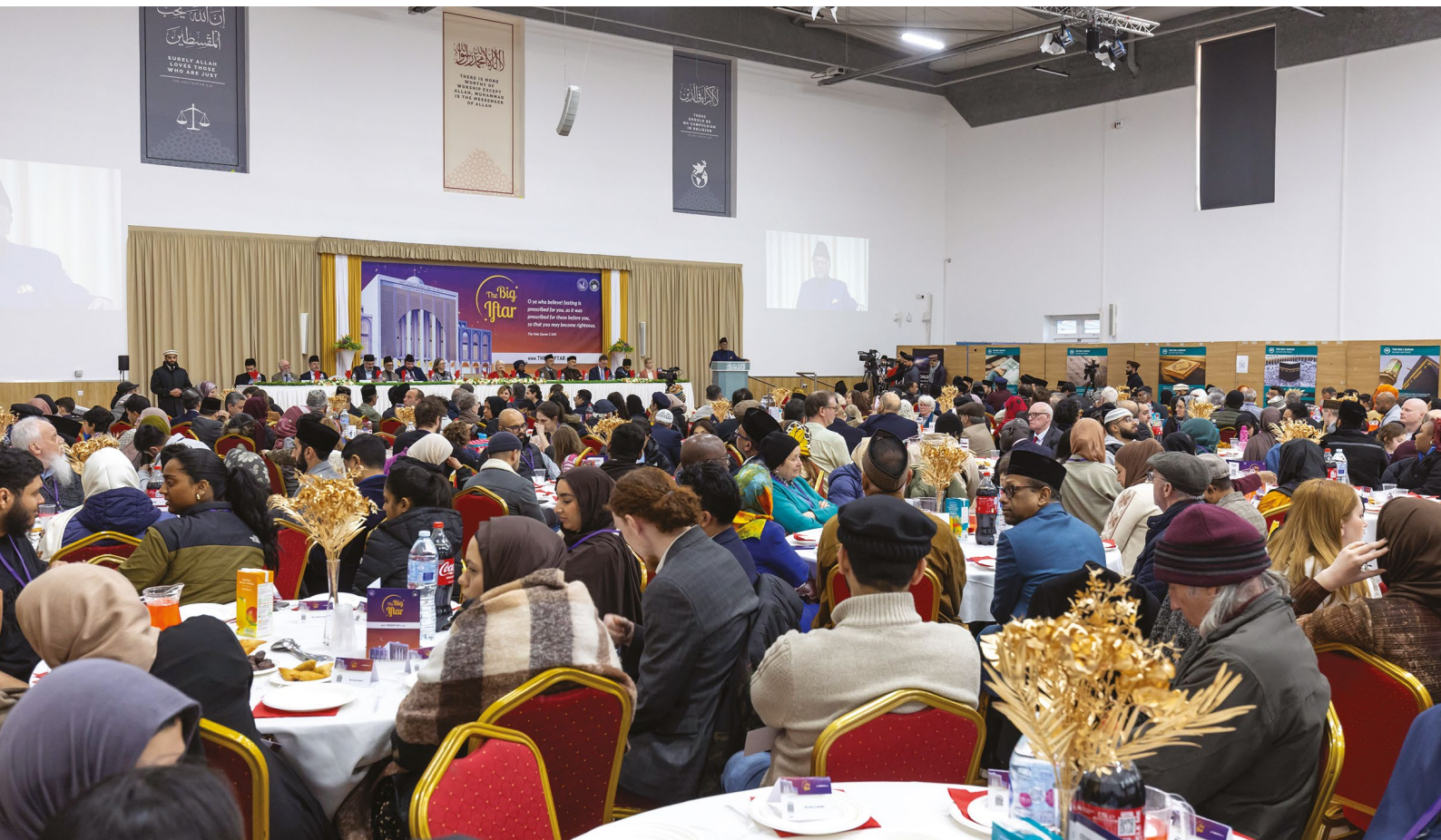
Tabligh (Outreach & Propagation), The Big Iftar

During the Jalsa Salana, the Department organised special sessions tailored for diverse groups, including Persian-speaking attendees, the Bangladeshi community, new converts, and newly joined Ahmadis. A major event held in the Arab Marquee attracted around 500 participants, featuring insightful speeches delivered by distinguished scholars and speakers. In addition to hosting the Big Iftar (breaking of the fast during Ramadan), a National Missionary Conference gathered 51 participants, focusing on enhancing missionary skills and reinforcing core Islamic values, whilst the National Tabligh Conference brought together 304 attendees, including leaders and Tabligh workers from across the country, providing extensive training, motivation, and guidance for future efforts. In