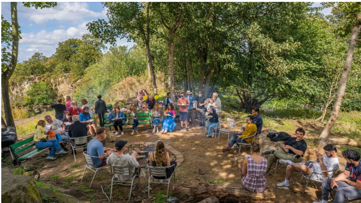
Barnton Bunker BBQ

has also engaged with a range of stakeholders, including public bodies, community organisations, and other partners, in support of the delivery of its charitable purposes. These activities have been complemented by an ongoing programme of events and initiatives, enabling the Society to make full use of the bunker's unique and varied environment. In doing so, the Society has provided opportunities for a wide range of people to access and participate in activities at the bunker and its unusual history in a variety of meaningful ways.