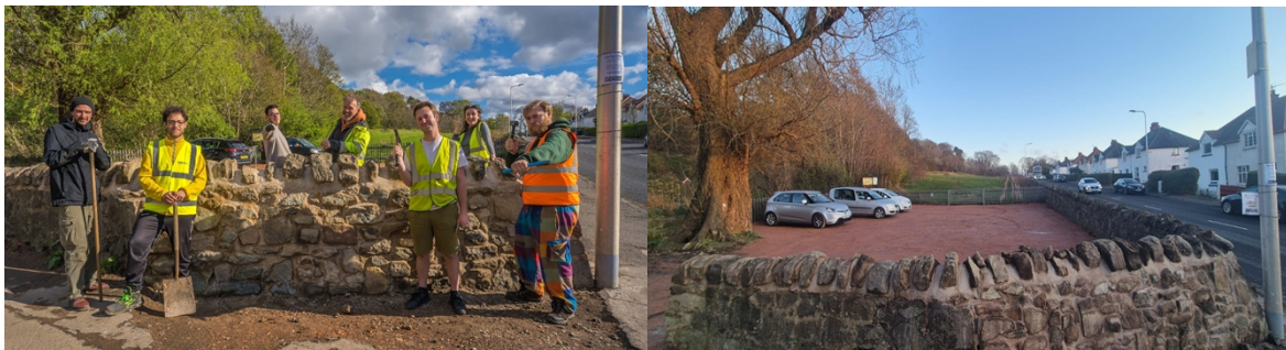
Volunteers involved in renovating public carpark

A key focus of activity during the year has been the improvement of access and infrastructure to support public engagement. In agreement with the The City of Edinburgh Council, the Society undertook works to widen the access from the main road by removing and rebuilding a stone wall further back from the driveway. This enabled improved access for larger vehicles, including coaches. In addition, the car park was regraded and extended, creating additional parking capacity for public use.