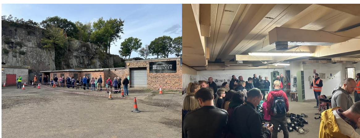
Doors open day event

The trustees consider that these activities have delivered meaningful outcomes in preserving the bunker, enhancing public access, and increasing awareness and engagement with this unique heritage asset, while laying strong foundations for future development.