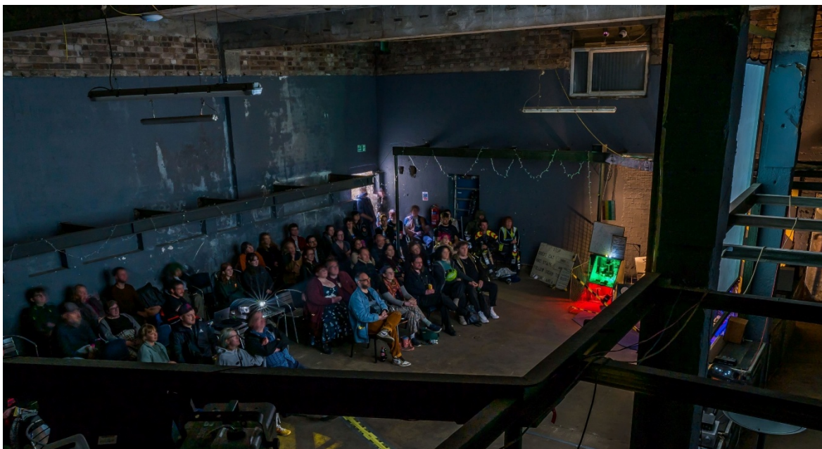
Barnton Bunker events room

The Society's principal aim is to safeguard this nationally significant Cold War site and to ensure that its historical importance is maintained and made accessible to current and future generations. In pursuing these aims, the organisation undertakes activities designed to conserve the structure, interpret its history and promote wider understanding of its role within Scotland's heritage. The Society is continuing to develop the site as a nationally significant heritage and cultural venue with active public use.