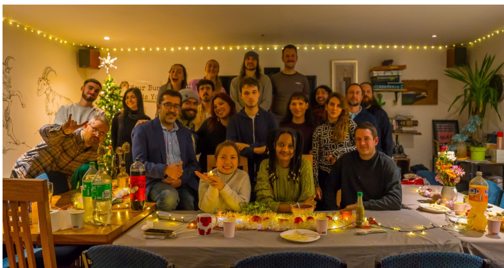
Communal meal at Barnton Bunker

The work of the Society has been supported by a substantial volunteer contribution, with over 300 volunteers involved in activities during the year. Volunteers have played a central role in site maintenance, event delivery, project development and operational support. Their commitment and contribution have been essential in enabling the progress achieved.