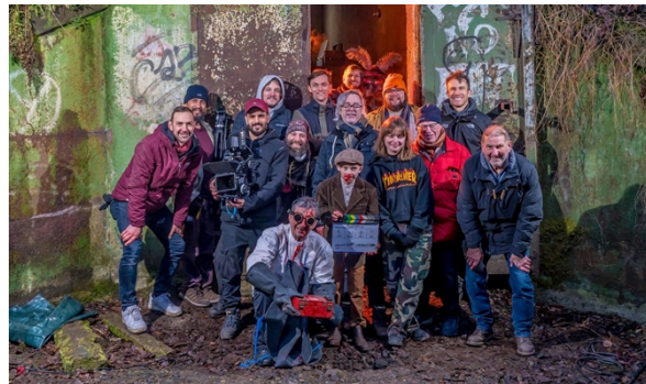
Film set and crew at Barnton Bunker rear exit

The organisation has further developed its educational and interpretive offering through a partnership with The Bunker Experience Ltd, delivering structured and scripted tours of the bunker. The site has also welcomed visits from schools and youth organisations, including scout groups, supporting learning and engagement with heritage.