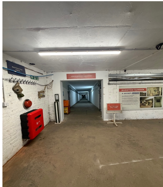
New entrance doors, lighting and signage