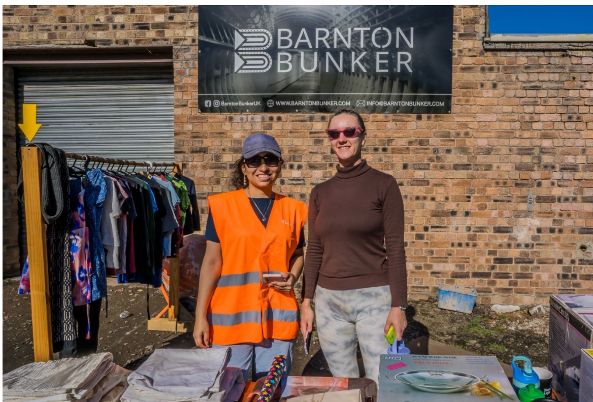
Garden Launch stall vendors

In terms of public engagement and use of the site, the Society has hosted a wide range of activities and events. These have included partnerships with film production companies and student projects, private events, and participation in Doors Open Days, which has helped to increase public awareness of the site. The Society also received a grant from The City of Edinburgh Council to create a community garden on site, followed by a large scale public open day to welcome the community into the space. This event featured local vendors, live music, and community activities, attracting approximately 2,000 attendees.