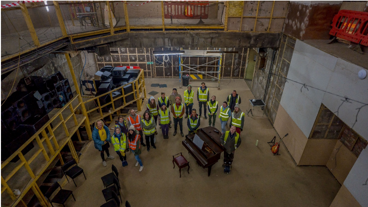
Barnton Bunker Operations room