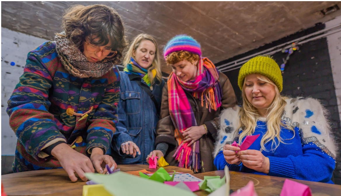
Artists at Kaizen event

included the Magic Labyrinth event, which over two successive evenings brought magicians from across the United Kingdom to perform short shows in different parts of the bunker, and the Kaizen event. The Kaizen event was supported by a grant and delivered as a free public art event hosted at Barnton Bunker, welcoming participants of all ages to take part in a range of creative activities, including painting, sculpture, mixed media work, and experimental forms of visual expression. The event also featured professional artists exhibiting their work, further enhancing the creative experience.