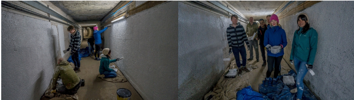
Volunteers painting the tunnel into the Bunker

The Society has also made substantial improvements to the safety and operational condition of the site. This has included the installation of new emergency lighting and fire doors throughout the building, upgrades to the CCTV system, and the installation of fibre optic infrastructure to improve connectivity across the property. Ongoing maintenance works have continued throughout the year, including addressing roof leaks, clearing drainage systems and undertaking internal refurbishment works such as painting and general repairs.