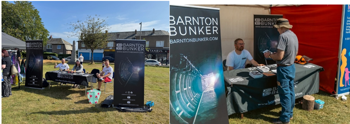
Volunteers promoting Barnton Bunker

The Society has continued to promote the site at external public events, helping to broaden awareness and engagement beyond the immediate locality.