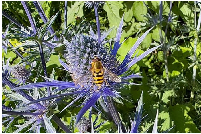
Wild garden open day at Seymour House, Port William