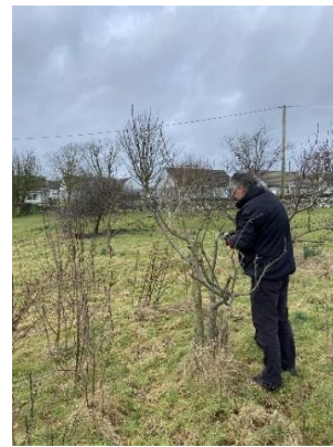
Incredible Edible Whithorn volunteers working in the Castlehill 'corner garden' and the local park