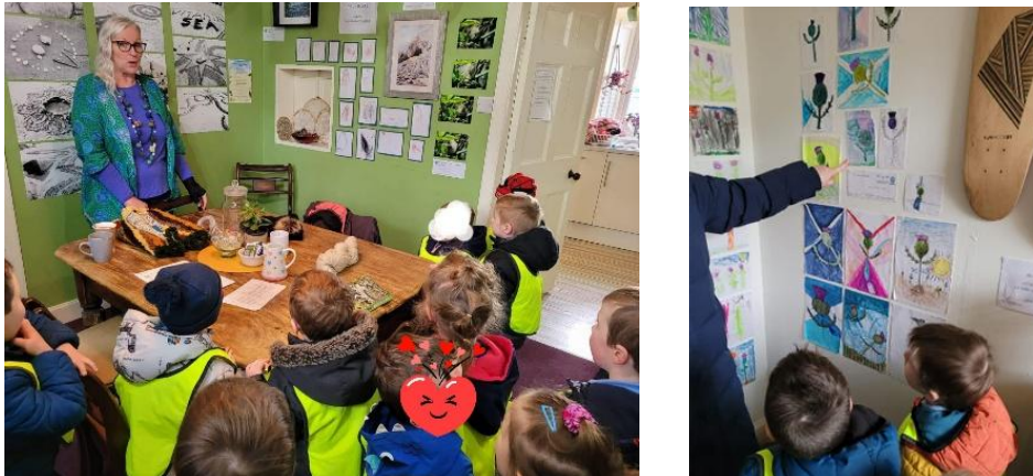
Children visiting the Art Exhibition

Over 130 visitors came to the exhibition in Port William, welcomed with teas, coffees and cake. As well as discussion of issues relating to climate change and biodiversity loss, there was an environmental poetry reading session and a music session.