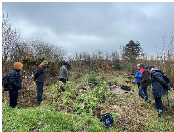
Late winter hügelkultur beds at MAC-CAN Croft

ACT visited the South Machars in early February and enjoyed a tour of MAC-CAN Croft, lunch at our local community centre, along with a discussion about all the creative use that is made of its multi-functional space. The afternoon was spent exploring the ever-expanding activities taking place at Number 12.