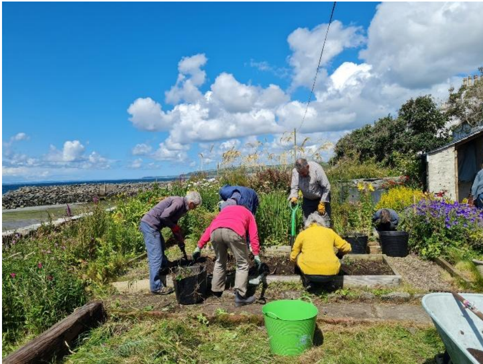
Restoring the garden at the back of Number 12

The Crofters and MAC-CAN volunteers came in July and turned the garden around. We are very fortunate to have such helpful partners.