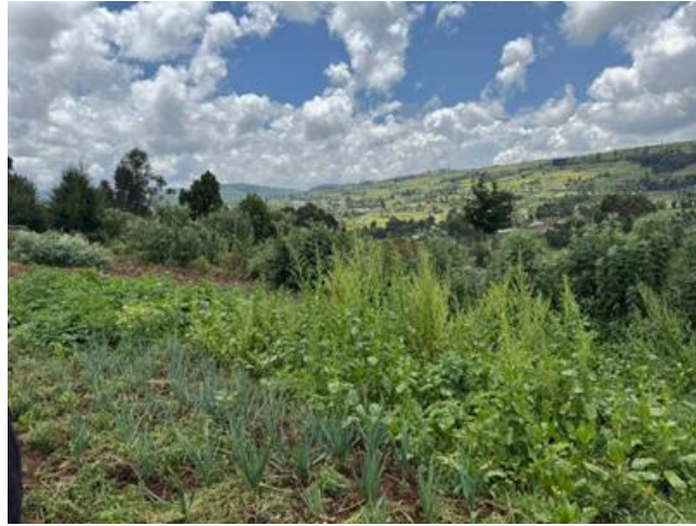
Crops growing in a subsistence farm in Likia, Kenya

communities have exchanged practical ideas about building local resilience in the face of the climate and nature crisis and, also, how locally developed, sustainable practices can connect people and ideas across continents to tackle global challenges.