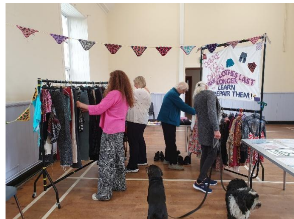
Clothes swaps and crop swaps are often combined

“Many thanks to Fiona for bringing the clothes swap to Kirkiner Hall. There were some very happy people parting with outfits they didn’t wear and going home with things they definitely will!”