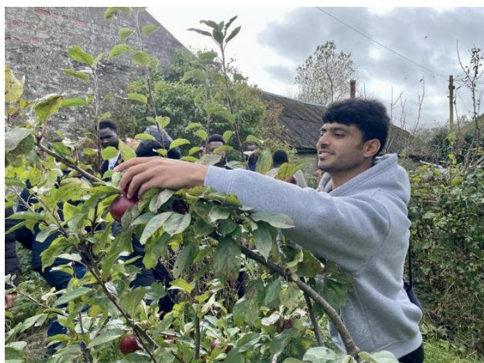
Dumfries asylum seekers enjoying MAC-CAN Croft orchard