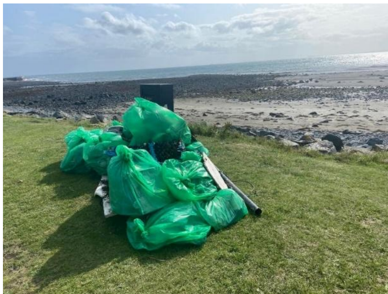
254 kilograms of litter collected from the beach at Port William, August 2025

Based on the success of these events, MAC-CAN with Number 12 organised a second Beach Art Day in August 2025. Better weather and the presence of holiday makers made for more folk getting involved. Thirty budding beach artists and around 40 visitors attended. Prior to the art event we organised a beach clean in conjunction with 'The Green Britain Foundation' and 'Fish Net Zero'.