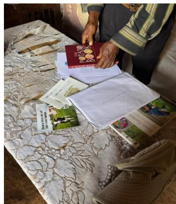
Books from Galloway appreciated by the African farmers

This ongoing collaboration between MAC-CAN and Likia demonstrates the power of dialogue, practical exchange, and community-led innovation in shaping responses to climate change and building resilience.